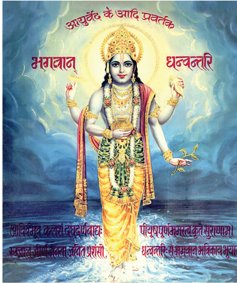
“Lord Shri Dhanvantari