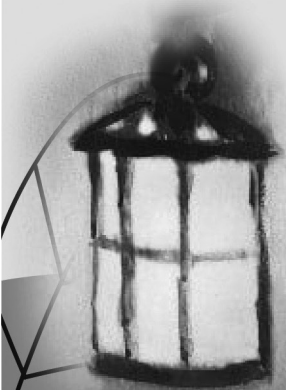
Florence Nightingale (May 1820 – August 1910)